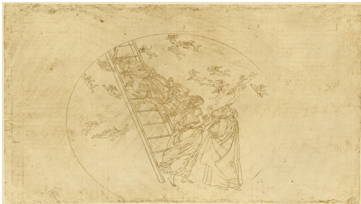
From a copy of Dante's Commedia illustrated by Sandro Botticelli (c. 1485)

This concept remained central in later Neoplatonic thought and also fused with Christian thought in the Middle Ages and Renaissance, as writers and artists depicted their own ascents towards Divine Love (e.g. in Dante's Divine Comedy ).